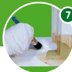
Apply paint finish