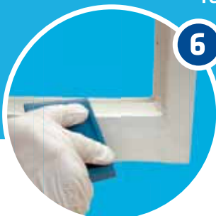
Smooth the surface