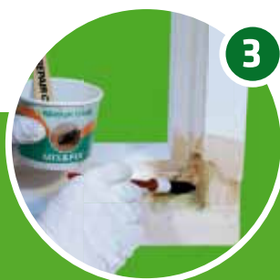
Prime with DRY FIX®