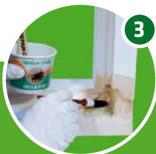
Prime with DRY FIX®