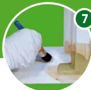
Apply paint finish