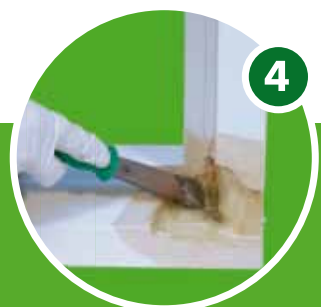
Apply DRY FLEX®