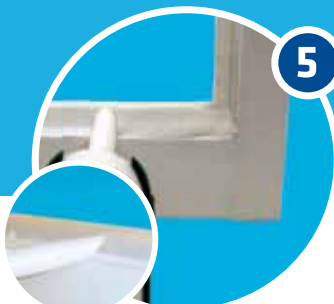
Cut the nozzle to form the glazing profile and apply DRY SEAL™