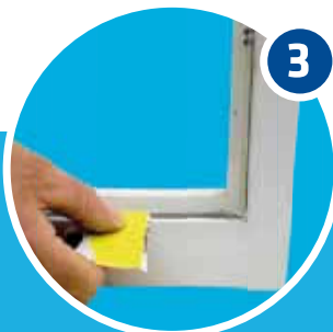
Clean and sand rebate