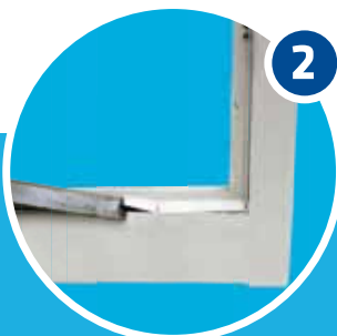
Remove loose putty