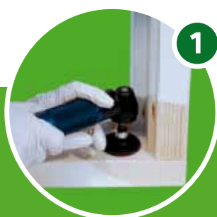
Remove paint & dirt